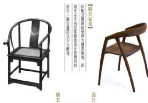
Figure 15: The inspiration of Ming furniture to modern furniture

Creating a cultural atmosphere. The cultural ethos of traditional furniture is well recognized, and the cultural ambiance of traditional Chinese ornamental items is these mysterious spirits (Jin et al., 2022). These pieces of furniture, which are also attractive, convey a sense of unwavering calm without using words. They infuse the modern, fast-paced living environment with a touch of peace and vintage comfort as if they were recounting the tale of a thousand years. For instance, a study room with traditional Chinese desks and bookcases might have a strong bookish