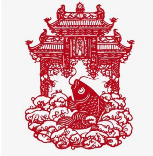
Figure 1: Gain quick success

decoration. A thorough examination of traditional Chinese ornamentation enables us to comprehend the material lifestyles of the ancient Chinese while also providing ideas for modern home design. Efforts are made to realize the ultimate care that design brings to people(Wang, 2021).