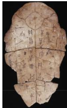
Figure 3: Oracle bone Inscriptions