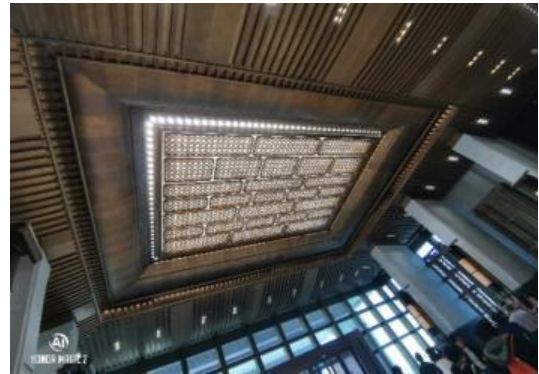
Figure 13: Application of window pane elements

and uniformity that modern concrete structures bring. The author thinks that carving the columns or combining them with murals would increase their artistic appeal. Second, begin by considering windows that are dripping. Leaky windows are the artistic embodiment of leaky windows and a more sophisticated component of modern interior design that can reflect the relationship between seclusion and openness. Windows is divided but not totally separated and permeable but not fully permeable. To achieve harmonious beauty and to exude the connotation of traditional culture and a rich sense of hierarchy, the traditional short hollow window staff should be used properly in modern interior design practices to create a blur of light and shadow, add an endless sense of anger and flow, and separate various functionally different compartments(Guo & Dai, n.d.).