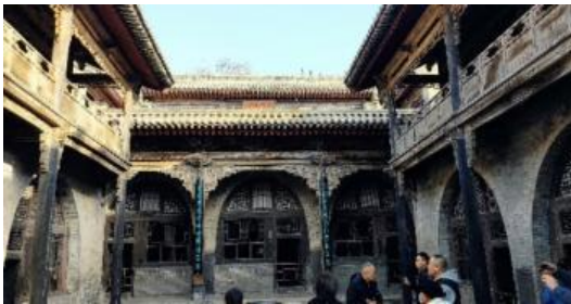
Figure 12: Shanxi houses

Walls, hu funnel windows, and columns are examples of traditional Chinese architectural constructions. These elements have long been linked to interior design, presenting a variety of novel design creation techniques in places like Beijing courtyards, Shanghai lanes, Shanxi houses, and Fujian Hakka tulou, all of which effectively combine local culture with interior space(Wei et al., 2014).