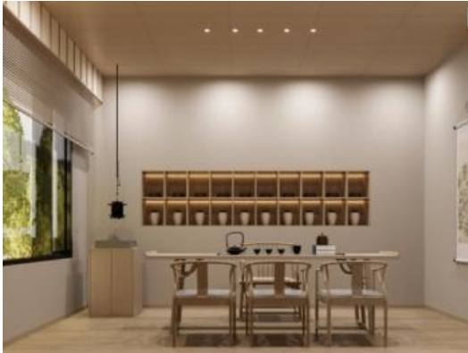
Figure 14: Direct use of Ming-style furniture

others emphasize ornamental beauty, as is indicative of the dichotomy between the Ming and Qing dynasties' furniture. Traditional furniture can be matched reasonably with the home design by being basic, appealing in shape, and functional. Red tape reduction Qing furniture can be stripped of its intricate adornment, and contemporary style increasingly favors quick, simple designs. Interior design for modern society is a service that simplifies the design of bulky conventional furniture to adapt to modern people's aesthetics.