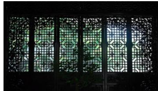
Figure 5: Window lattice