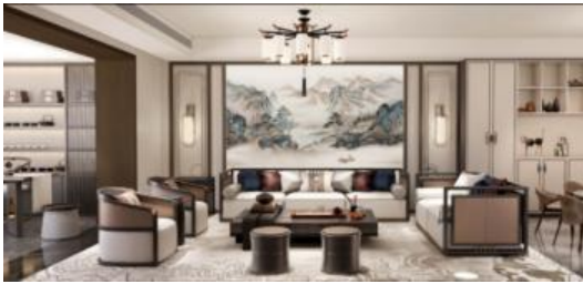
Figure 11: Traditional patterned carpets

connection of interior space, take into account the needs of spiritual function, and properly harmonize with the general environmental style. Finally, consider how conventional fabric ornamentation is used in contemporary interior design. In the stressful modern world, traditional materials like pillows, carpets, and curtains are quite popular. Traditional needlework methods and three-dimensional fabric shapes can be used to transmit fortunate and lovely symbolic meanings and produce strong Chinese charm(Zhou, 2016).