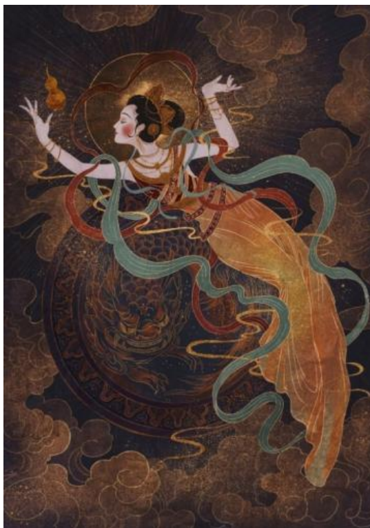
Figure 4: Mogao Cave Murals at Dunhuang