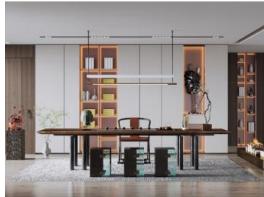
Figure 16: Study Room

vibe to it, giving the people who live there a material and spiritual living space (Teasley, 2002).