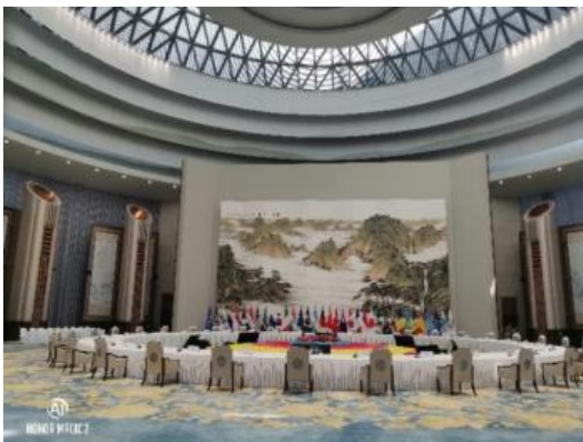
Figure 7: Landscape painting application examples

materials. People prefer simple, generous designs with grandeur, yet more intricate patterns can create a convoluted, melancholy environment. The ceiling decoration has a significant visual impact on the interior, so designers may want to draw inspiration from traditional decoration patterns like flying patterns, lotus patterns, bird patterns, flower well patterns, etc. to convey a particular mood. These patterns reflect the style and allure of the past. Second, the inside walls may be decorated with conventional designs. After having a thorough understanding of the many indoor space types, it can be decorated with frescoes, hanging screens, and other traditional patterns depending on the practical scope, purpose, and demands of the users. Examples of these spaces include hotel lobbies, exhibitions, and other walls. To add some beautiful patterns to the interior floor and play a perfect decorative effect, traditional patterns may also be used to enhance the cultural charm of the interior design space(Lu, 2022).