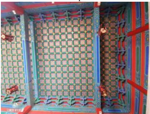
Figure 8: Examples of traditional patterns in ceiling applications