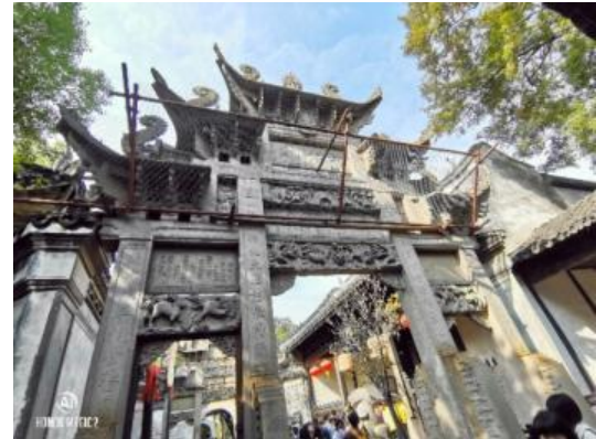
Figure 6: Carved stone pillars