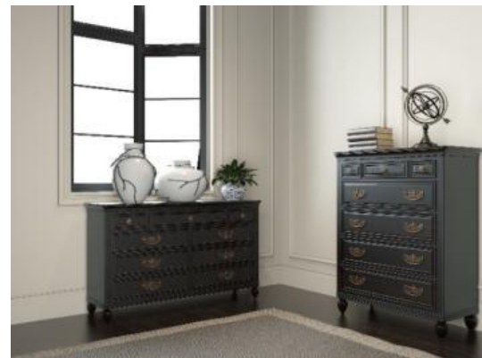
Figure 10: Craft Application Examples

Paintings and calligraphy, handicrafts, and ornamental fabrics with a strong Chinese influence are examples of traditional furniture. When these items are placed inside, a gentle, exquisite, introverted affinity and a sense of nostalgia are created. First, we discuss how traditional calligraphy and painting can be incorporated into contemporary interior design, which, like poetry, can provoke thought. A framed scroll or table frame decoration is a common example of how the application in current interior design should be able to carry on the tradition and represent the times and personal style. For instance, the distinct charm of traditional Chinese writing can be conveyed through the brushwork, chapter organization, and Chinese calligraphy, which also infuses creativity into ornamentation.